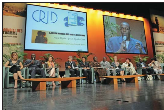
Special event organised with the CRID Summer University of International Solidarity